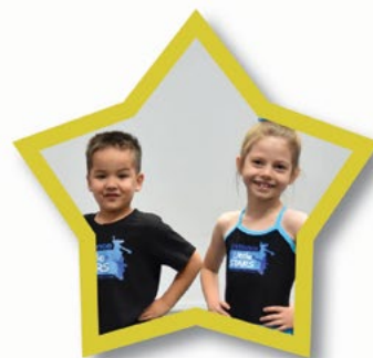
LITTLE STARS 5 - 6 yo