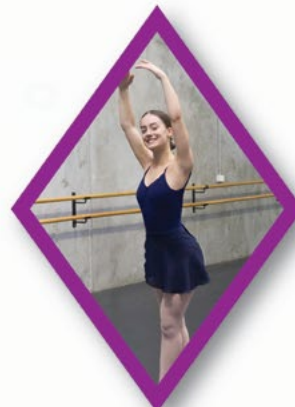
DIAMONDS 16 yrs+