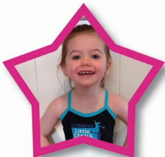
LITTLE STARS 3 - 4 yo