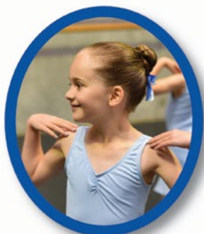
SAPPHIRES 6 - 9 yo