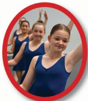
RUBIES 13 yrs+